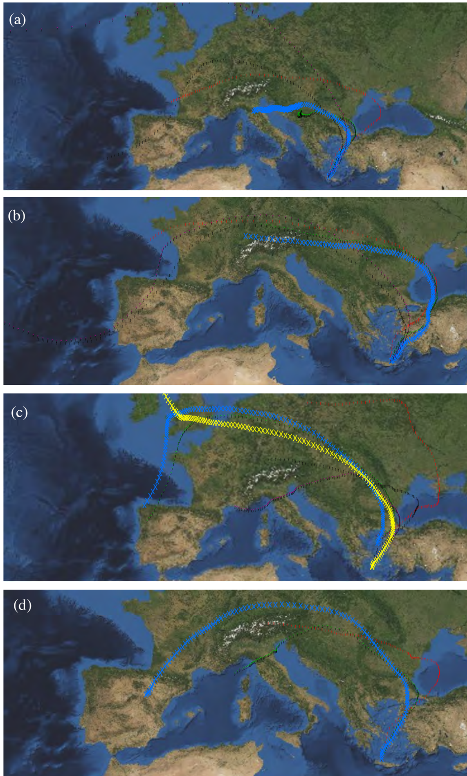
Figure S3. Wind back trajectories (120-hours long) calculated by NOAA's HYSPLIT model for the different positions of the aircraft during the flight on the 4th of September 2011. The calculations have been performed when the aircraft was over Chania at 11:00 UTC (a), over eastern Crete at 12:00 UTC (b), over the Lemnos and northwestern of Crete at 13:00 and 14:00 UTC, respectively (c), and over Chania on the way back at 15:00 UTC, respectively (d). Different colors of the trajectories correspond to different flight altitudes: 500 m (red), 1500 m (green), 2500 m (blue), 3500 m (black), and 4500 m (magenta).